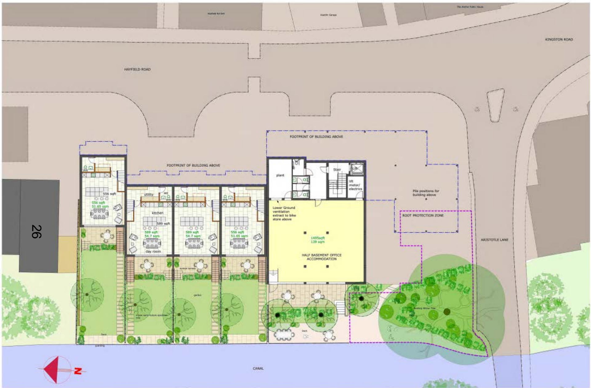
Proposed Basement Plan